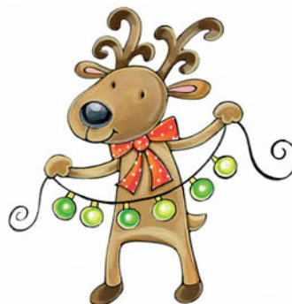
South Bay Orchid Society