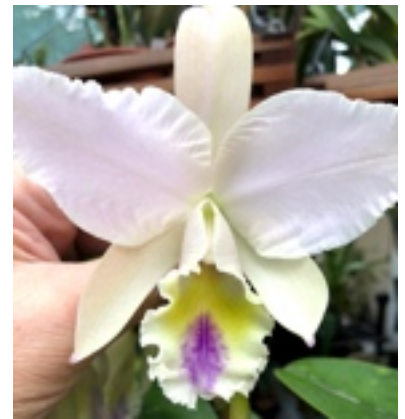
C. Portia Coerulea X Mossiae coreulensis