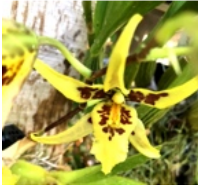
Mclra Yellow Star 'Stellar'