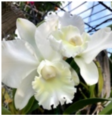
C. Takaki Snowy (Spring Climax X C. Christina Waglay)