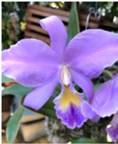
C. Portia var. Coerulea