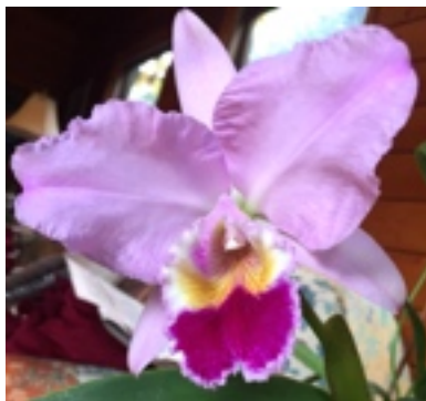
C. labiate Alba X sib