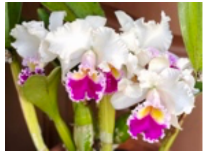
Lc. Persepollis Splendor,