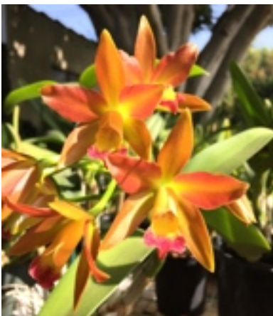
Slc. Acker's Romance 'Valentine' AM/AOS X Slc. Golden Wax 'Lone Star II' HCC/AOS