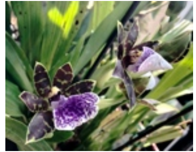
Zyg. Blue Blazes 'Barrie Ford'