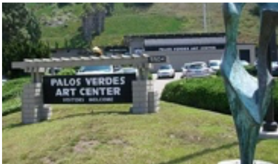
Our New Home !!

Palos Verdes Art Center 5504 Crestridge Rd. Rancho Palos Verdes