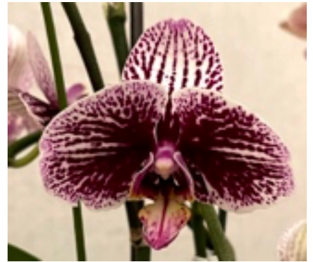
Dtps. Fuller's Mask X Dtps. Fuller's Black Stripes