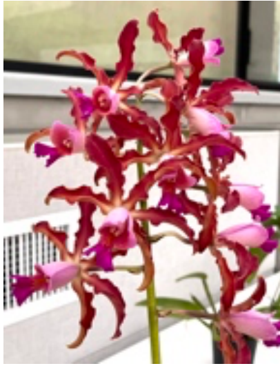
C. leopoldii X. L. purpurata