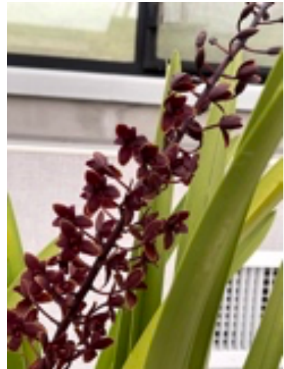
Cym. Little Black Sambo 'Black Magic' Grown by Larry Bergen