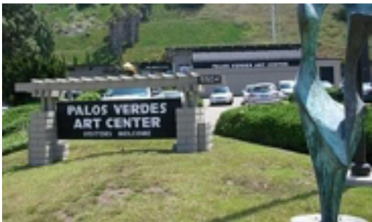
Our New Home !!

Palos Verdes Art Center 5504 Crestridge Rd. Rancho Palos Verdes