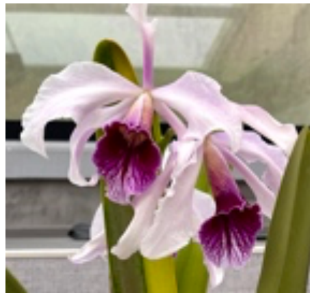
L. Purpurata Ibron HCC/AOS X Treasures of Carpenteria AM/AOS