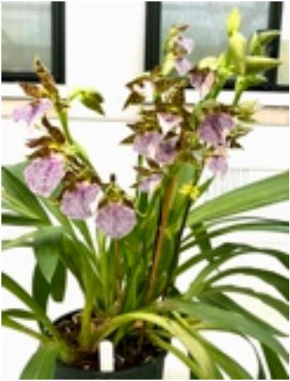
Zygo. mackyi X Artur Elle