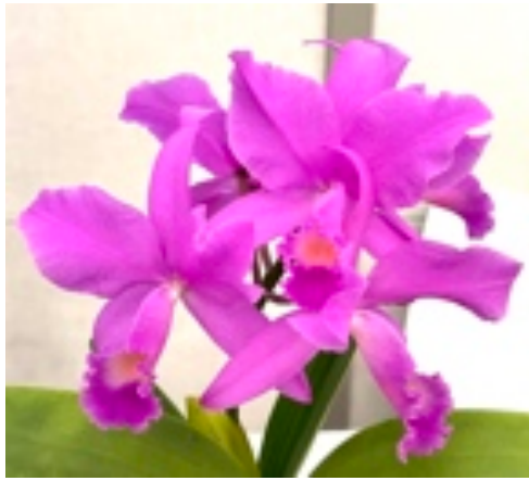
C. deckeri 'Brecht's'