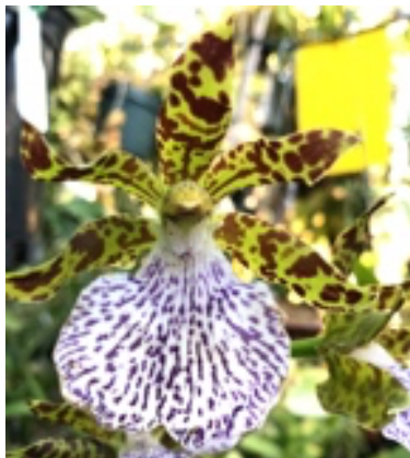
Oncostele Eye Candy 'Pinkie'