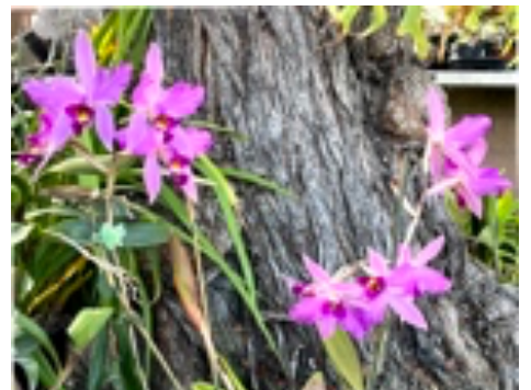
L. anceps Marcy's Valentine