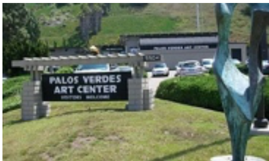
Our New Home !!

Palos Verdes Art Center 5504 Crestridge Rd. Rancho Palos Verdes