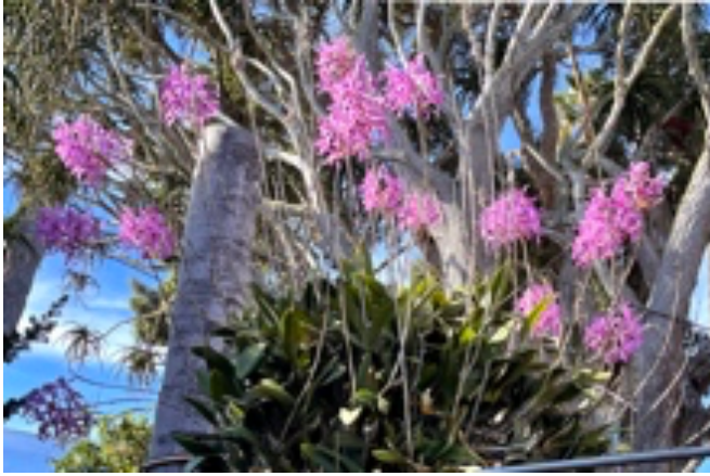
Santa Barbara Orchid Estates unknown aneeps on tree