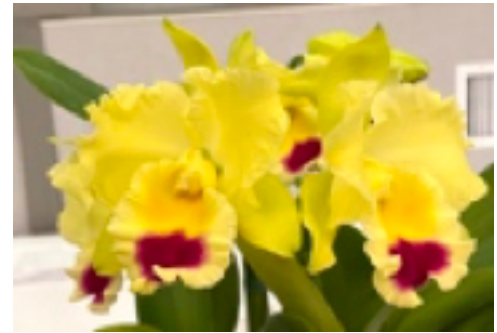
Blc. Goldenzell 'Lemon Chiffon' AM/AOS