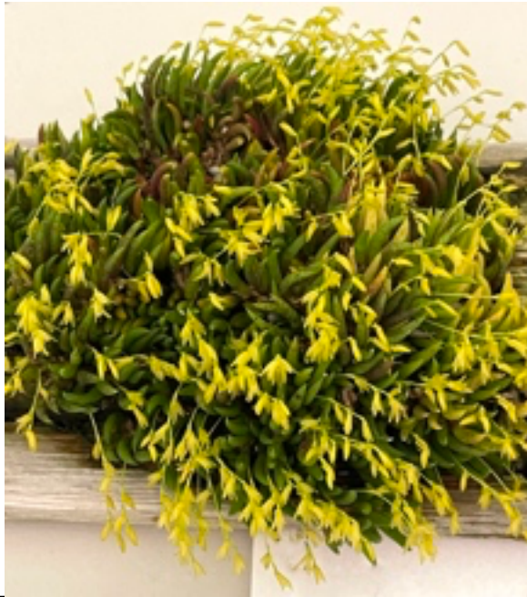
Speaker's Choice Pleurothallis leptotifolia Grown by Jim Hoyle