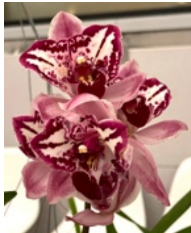
Cym. American Beauty