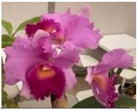
C. Bonanza Queen 'Panamint'

March 25 and 26, 2023 Hours: 10 am - 4 pm See award winning blooming orchids species and hybrids of all genera Buy quality orchids from commercial growers and vendors Tour the Palos Verdes Art Center Gallery