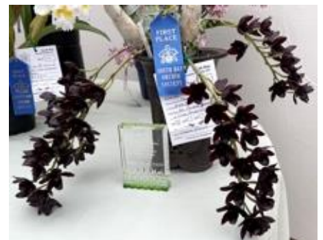
Fredclarkeara After Dark 'SVO Black Pearl'