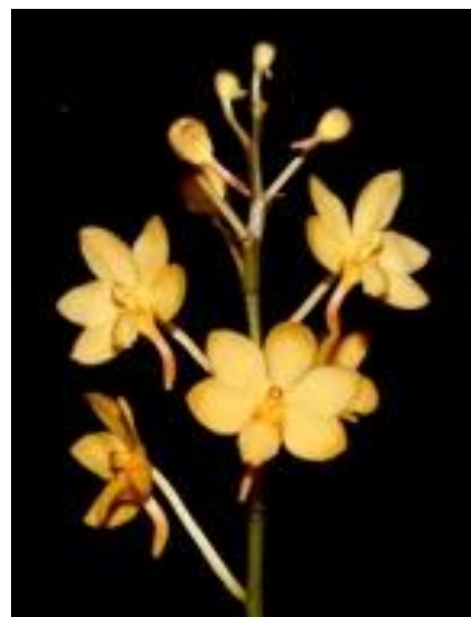
Vandaglossum Lemon Drop