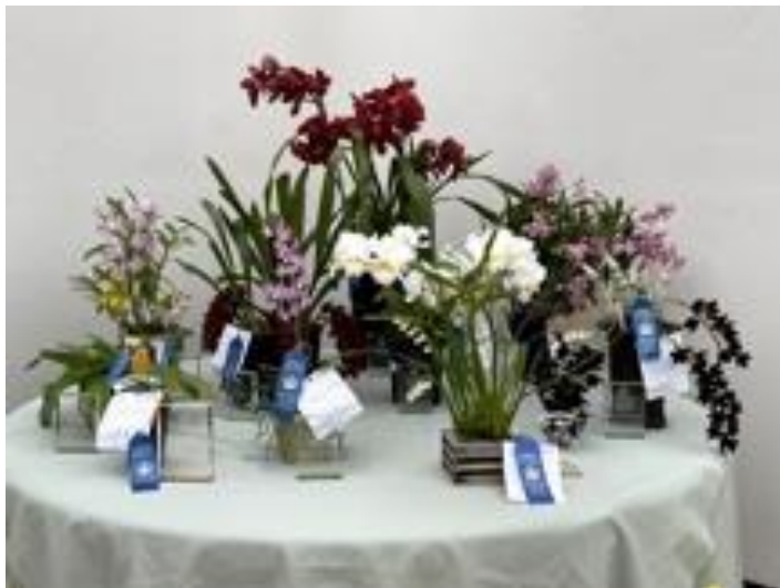
Best of Section Spring Show winners 2023