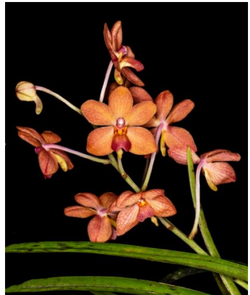
Vandaglossum (rupestre X V. curvifolium)