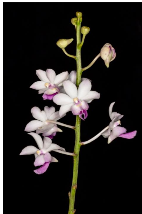
Holcorides Rosy Snowflakes

Although I teach middle school kids for a living, one of my passions has always been plants. I began growing orchids as an offshoot from working at Longwood Gardens in Philadelphia just after college. From the very beginning it was all about Paphs, particularly awarded and select clones of historic importance, of which my collection numbers nearly 3000. While I love finding old, rare stepping stones in paph breeding, I also do a little hybridizing of my own, and growing up my own babies is a blast. I am an accredited judge with the American Orchid Society, and have served in various capacities with various orchid societies in California and on the East Coast. I love meeting other people who like orchids too, and doing so often finds me traveling to shows, vendors, and peoples' greenhouses to see the latest and greatest in new hybrids and to get the best orchid gossip. I like to be involved in plants as much as possible: in addition to Longwood, I've worked at the Smithsonian Institution tending to their orchids, and for years for the United States National Arboretum, collecting rare plants and documenting cultivated species and hybrids for their herbarium. In short, I really like plants. Continued on page 2