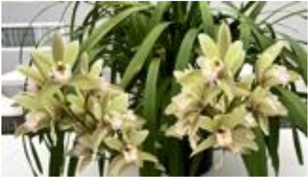
Cym. Unknown green