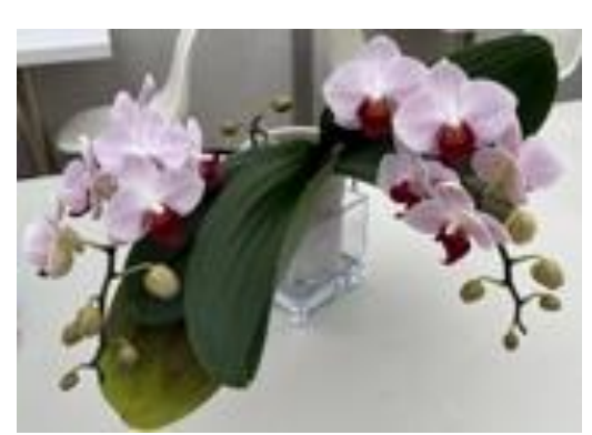
Phal. Unknown pink