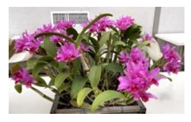
Speaker's Choice – C. Guatemalensis