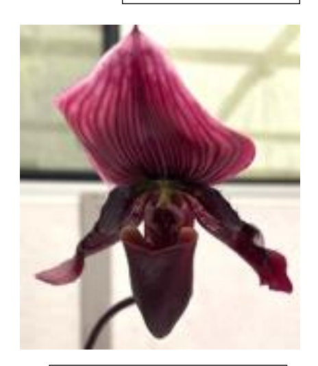
Paph. Magic Cherry