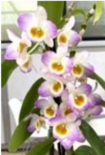
Den. Nobile Tianmu Green Elf