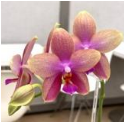
Phal. Sweet Memory 'Liodoro'