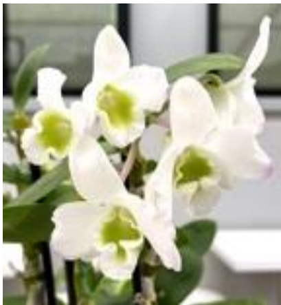
Den. Nobile Tianmu Green Elf