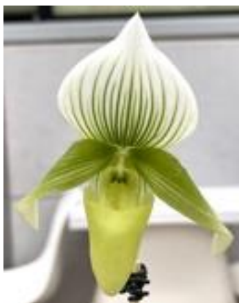
Paph. Oriental Aura