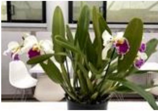
Lc. Stonehouse 'Leonard'