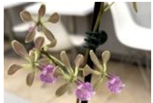
Encyclia Standard Setter