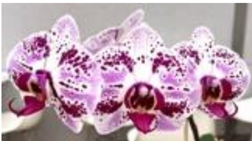
Phal. No ID