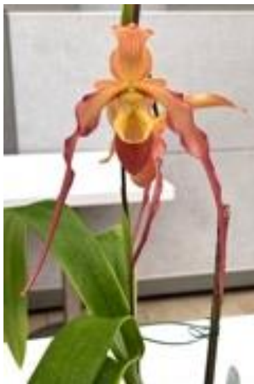
Phrag. Belle Hougue Point