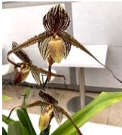
Paph. St. Swithin 'Gloria'