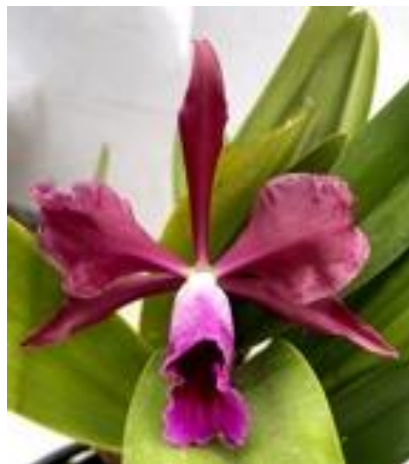
L. Pacavia X C. Massageana

Printed by AcroPrint (310)534-2276 http://www.acroprint.us