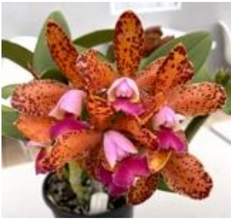
Speaker's Choice Blc. Waianae 'Leopard'