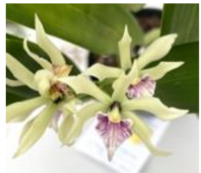
Psh. baculus hyb.