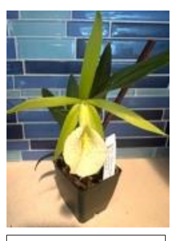
Pcv. Walnut Valley Lime Stars