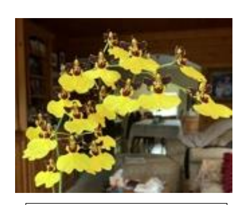
Onc. varicosum rogersii