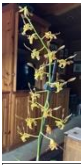
Den. Chocolate Antlers