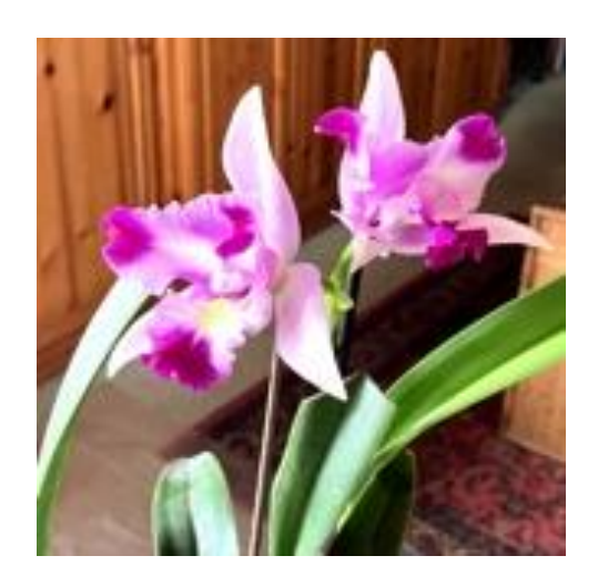
Lc. Miss Wonderful