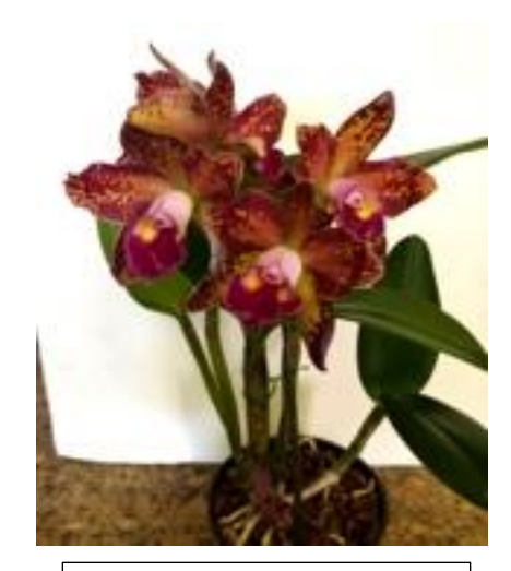
Blc. Waianae Leopard 'Ching Hua'