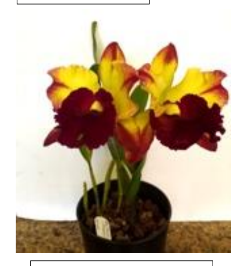
Blc. Toshie Aoki 'Pizazz' AM/AOS