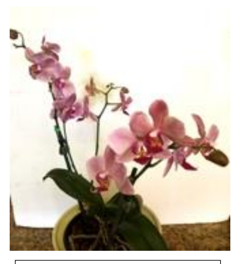
Phal. Alysha's Delight "New York' X P. Golden Buddra 'Zuma Beauty'