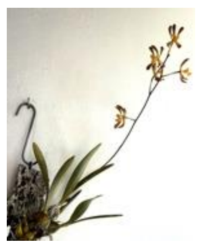
Enc. Mystery 'SM'